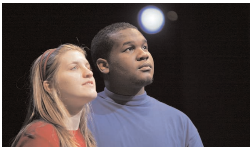
Photos from Summer Academy 2007 Showcase

The theme of this summer's program is musical theatre. The program will culminate in a showcase of the students' work, on Geva's Mainstage, which is open to the public. Students will be granted a certificate of completion from the Summer Academy 2008 program.